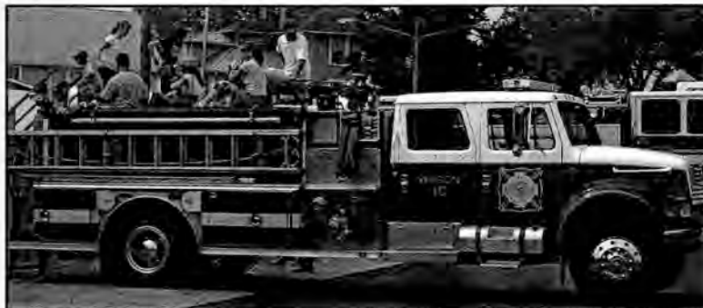
Fire Truck Rides at Lucketts Fair

Residents may stop by the fire house for blood pressure checks.