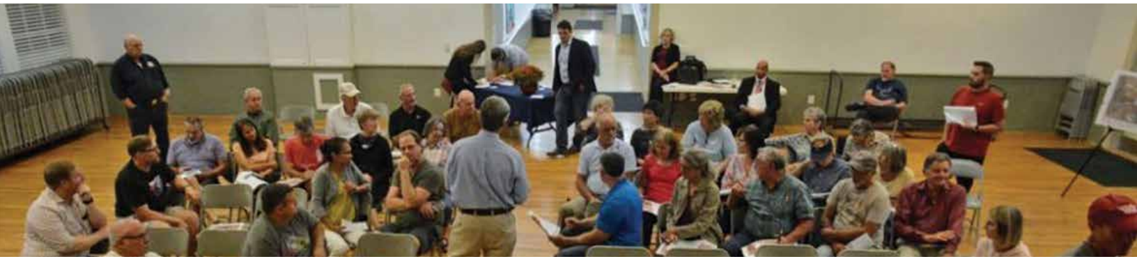
Renss Greene/Loudoun Now