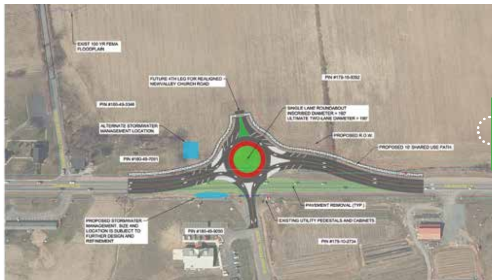
Roundabout with 4th leg for eventual realignment of New Valley Church Road