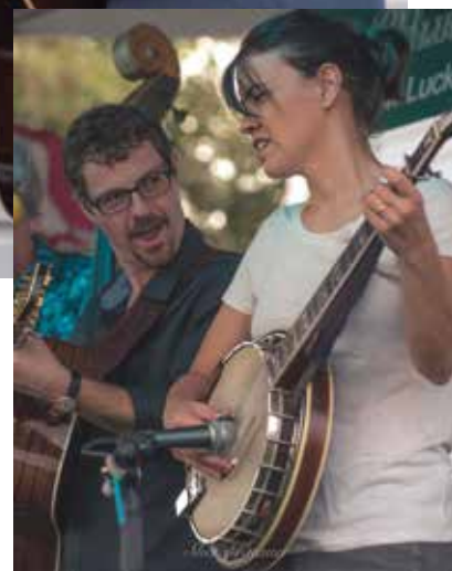
All Bluegrass photos by Sheri Knauer