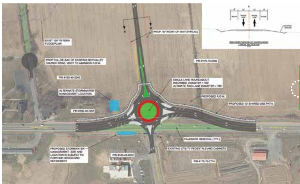
Roundabout with realignment of New Valley Church Road